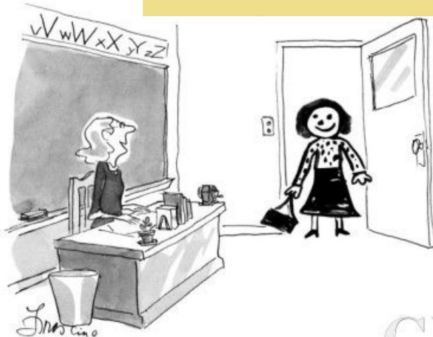
"Mrs. Hammond! I'd know you anywhere from little Billy's portrait of you."

A: YES! You should! Of course you should! (If you haven't received information about how to schedule a conference, contact your child's principal ASAP!)